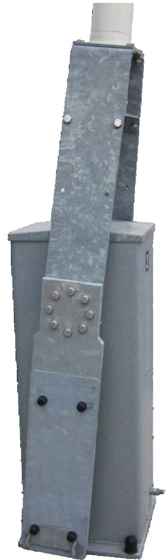
SPK10-10 barrier drive

The barrier can also be opened/closed manually if necessary. In this case, the supply lines to the motor and retaining magnet are interrupted by means of a locking switch. The boom can then be moved manually.