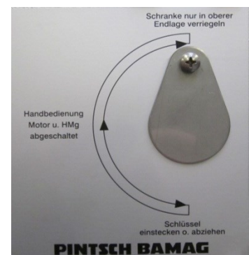
Locking mechanism notice plate